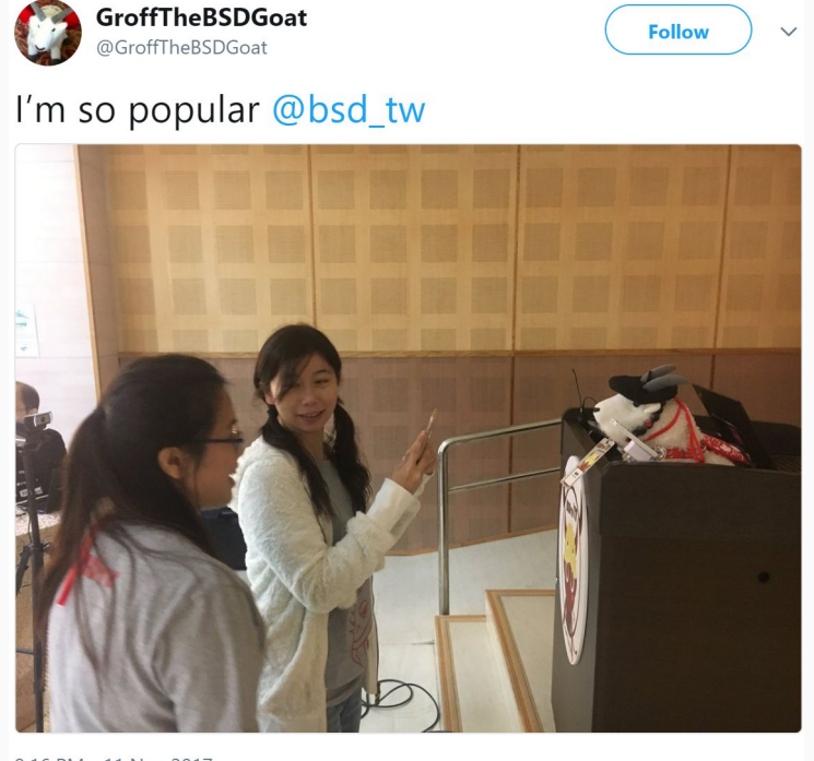
9:16 PM - 11 Nov 2017